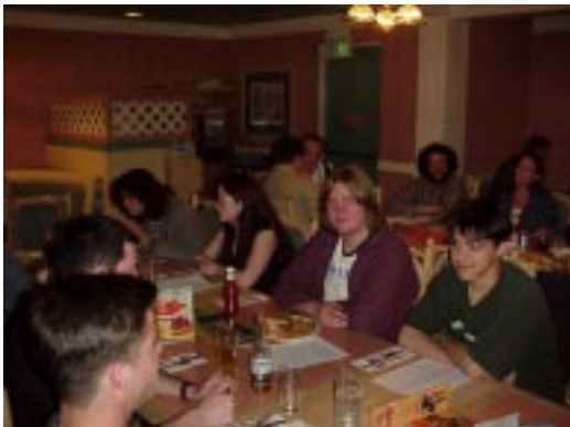
Attendees at our April 14 th Business Meeting