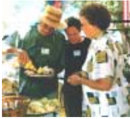
Guest partaking of delicious eats provided gratis by LPSCC