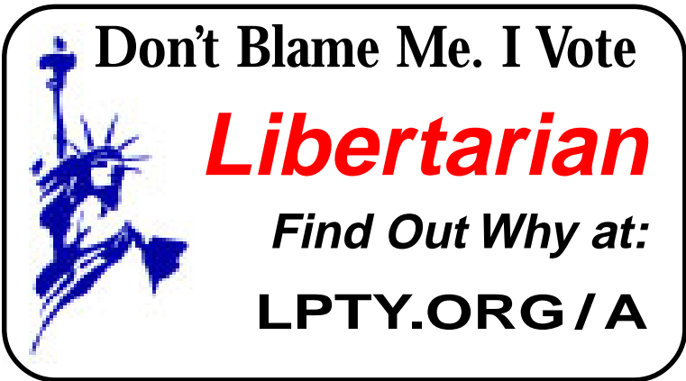
Proposed bumper sticker design based on bumper sticker from national LP

Please let me know by emailing me at rudin@lpty.org..... would you put one of these bumper stickers on the back of your car if it is made available to you by the party at no cost? Also do you already have one up? ■