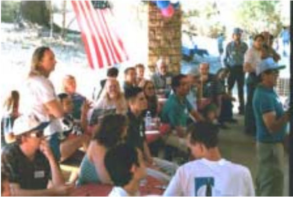
Audience giving rapt attention to one of many speakers