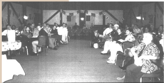
Crowd seen from speaker's position at middle of room (to get closer to audience due to unavailable speaker system)