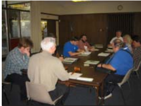
11 at 1st meeting of year (photographer-reporter is invisible)