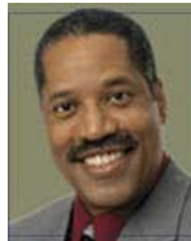
Larry Elder - on KNEW!

"American Enterprise magazine examined the political registrations of professors in 20 colleges and universities. The study divided the registrations into those belonging to a "party of the left" - either Democrats, Greens, or some other liberal political party; and a "party of the right" - either Republican or Libertarian."